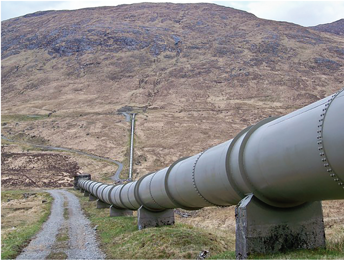
FIG. 3 – Water transfer schemes in the UK